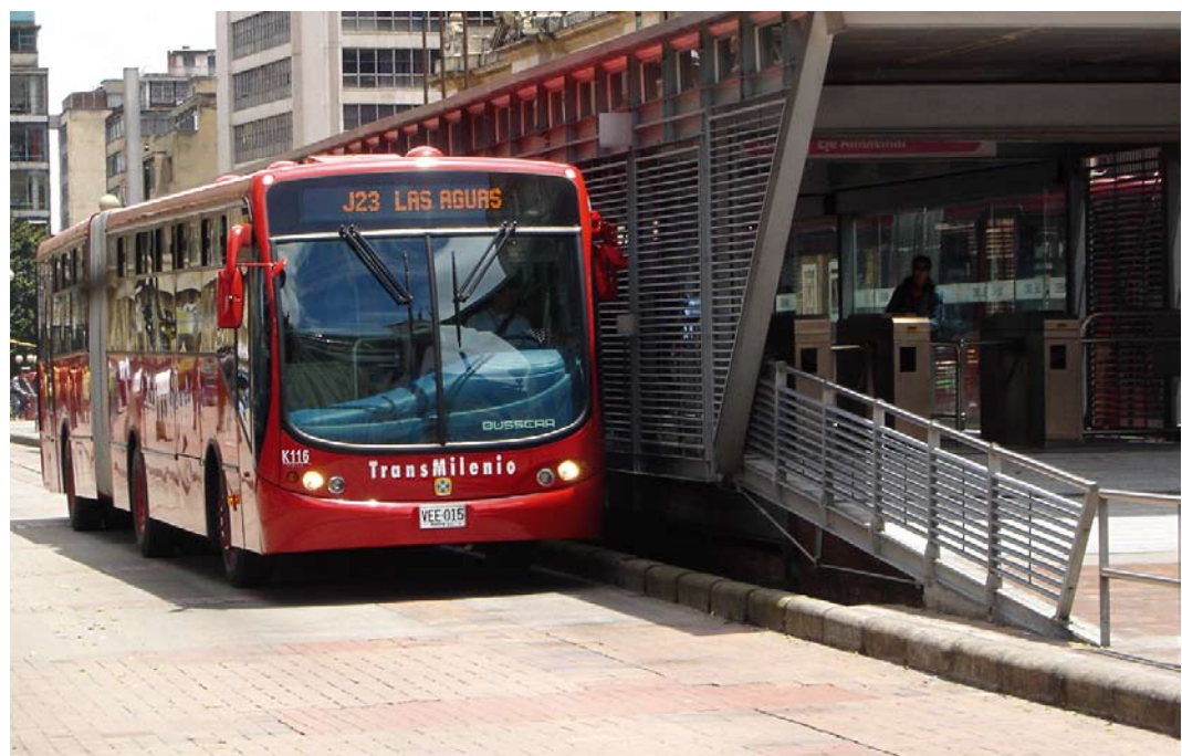
TransMilenio-Bus at a specially designed bus stop

Monitoring occurs as part of a separate programme which like the project itself was