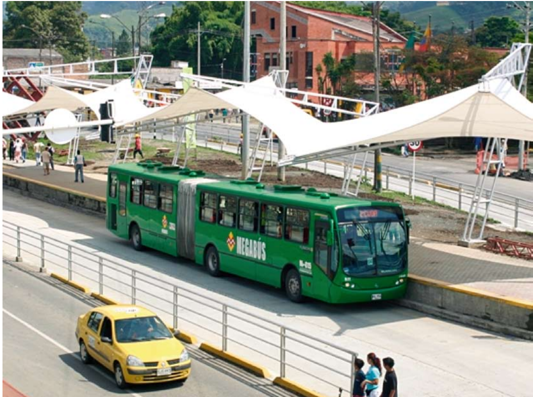
The Megabus project in Pereira, Bolivia. This Bus Rapid Transport project, developed by grütter consulting, is nearing CDM registration.