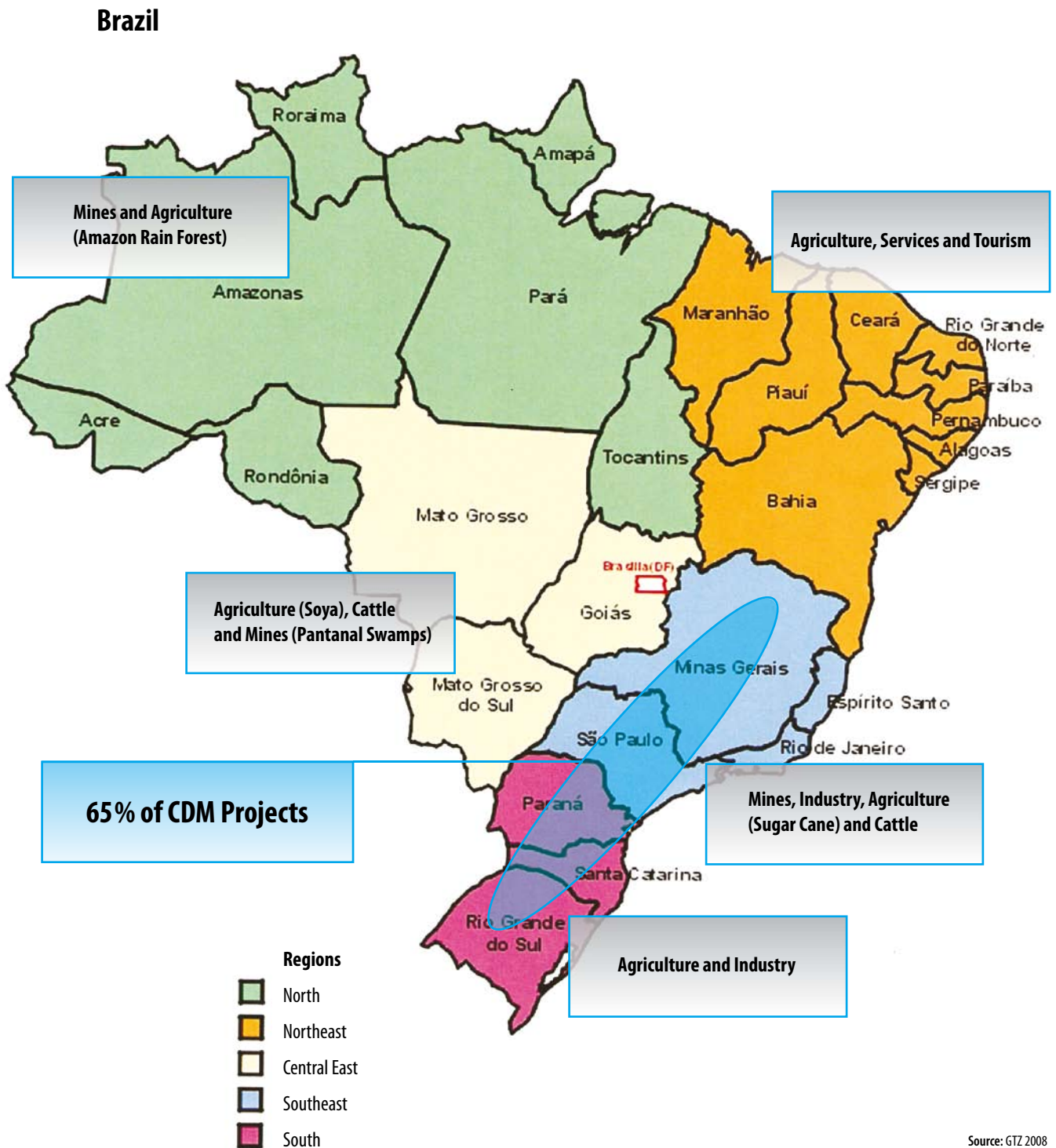
Figure: Regional distribution of key industry sectors and CDM projects.

dated approach provides German businesses and institutions with many new opportunities. As GTZ programme head Dirk Aßmann explained: "We hope that German participants make pro-active use of these new structures and put their strengths to good use in the Brazilian market".