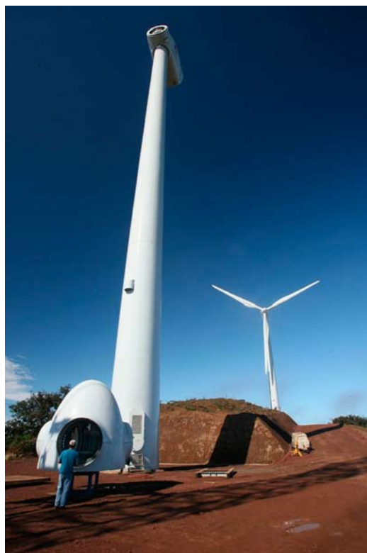
The San Cristobal Wind Power Project. This CDM wind power project is located on the Galapagos Islands. It is expected to save 70,000 t CO 2 e during its crediting period. The German project partner is RWE / e8.

As asymmetries in the carbon market may be smaller in more developed countries, they are certainly big barriers for CDM implementation in small countries. Capacity development activities for the CDM in Latin America implemented by UNEP and the UNEP Risø Centre have played an important role to overcome knowledge and informational barriers as well as helping countries set up their institutional preparedness and individual capacities for the CDM. Bolivia, Ecuador, Guatemala, Nicaragua, Peru and Surinam have all benefited from technical and financial assistance through the Dutch-funded CD4CDM Project. Other CDM capacity development activities in the region are about to be initiated by the UNEP Risø Centre focusing on other small countries such as El Salvador and Uruguay (funded by Spain) and the Caribbean islands (funded by the EC). UNEP Risøe has published a number of useful CDM materials on specific topics. Publications range from 'how-to' reference manuals, quarterly newsletters, annual perspectives features, to more cutting-edge research publications. All publications are available for download at http://cd4cdm.org/publications.htm .